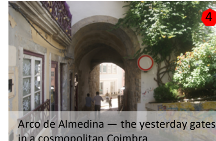
4 Arco de Almedina — the yesterday gates in a cosmopolitan Coimbra