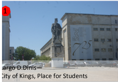
1 Largo D. Dinis — City of Kings, Place for Students