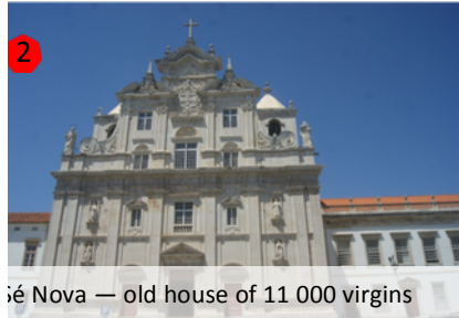
2 Sé Nova — old house of 11 000 virgins