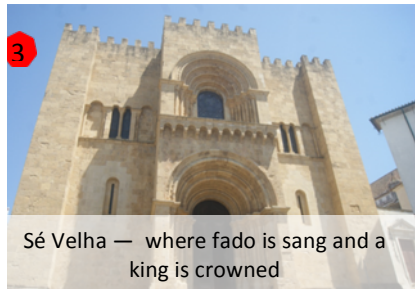
3 Sé Velha — where fado is sang and a king is crowned