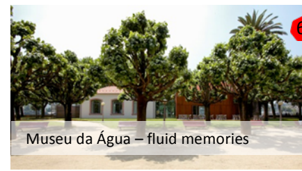
6 Museu da Água — fluid memories